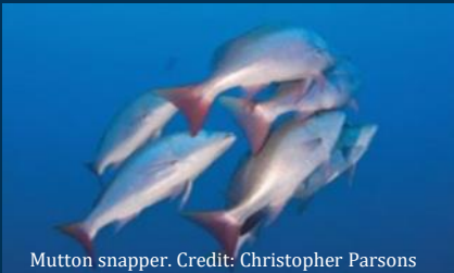
Mutton snapper.